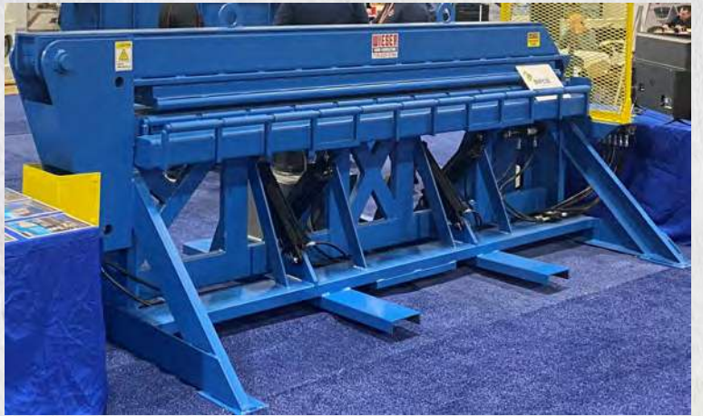
Wieser Form Fabrication display at booth 425.