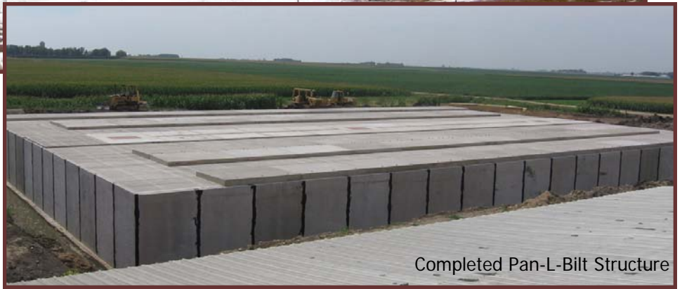
Completed Pan-L-Bilt Structure