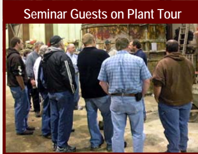
Seminar Guests on Plant Tour