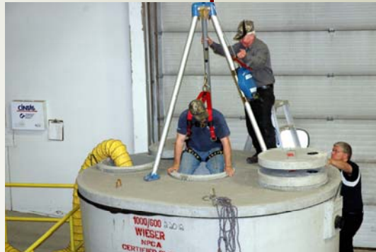
Cylinder-Test Demonstration at Fond du Lac Seminar

Wieser's training events would not be complete without the signa-